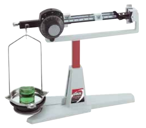
Dial-O-Gram United States Patent and Trademark Office Design Trademark Registration # 1,436,267