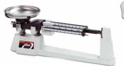
Triple Beam with Stainless Steel Pan (Model 710-00)