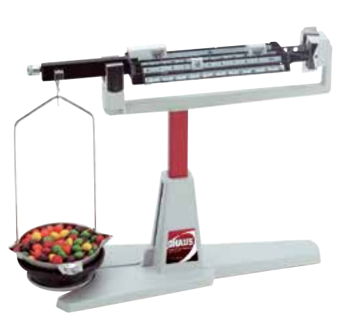
Cent-O-Gram United States Patent and Trademark Office Design Trademark Registration # 1,437,797

United States Patent and Trademark Office Design Trademark Registration Number 1,439,006 (Registered 1,437,111 with dial)