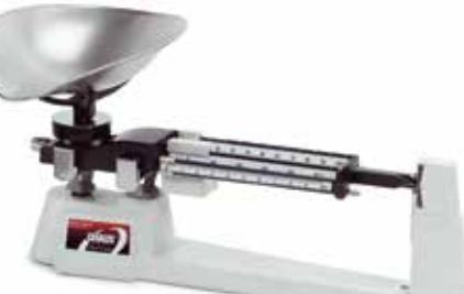
Triple Beam with Stainless Steel Scoop (Model 720-S0)