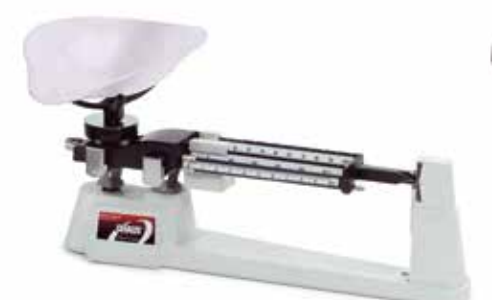
Triple Beam with Polypropylene Scoop (Model 720-00)

Designed with same quality and craftsmanship as the standard OHAUS 750-S0, these triple beams serve specific classroom needs by offering scoops, animal containers, pans, tare beams and more! Refer to the chart below for specific configurations. Each balance offers a generous 5 year warranty and the same accurate results you've come to expect from an OHAUS balance. Grades 4-12 (Ages 10 & up)