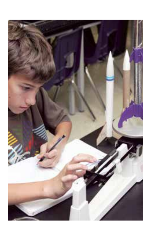
Triple Beam with Animal Container (Model 730-00)