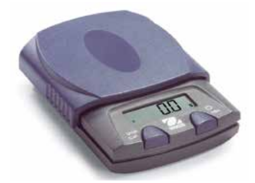
Every CS model includes a stainless steel pan and AC Power Pack (a $40 value!)